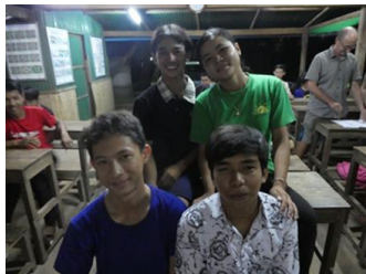
Class 6 finalists