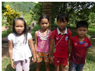
Class 1 finalists