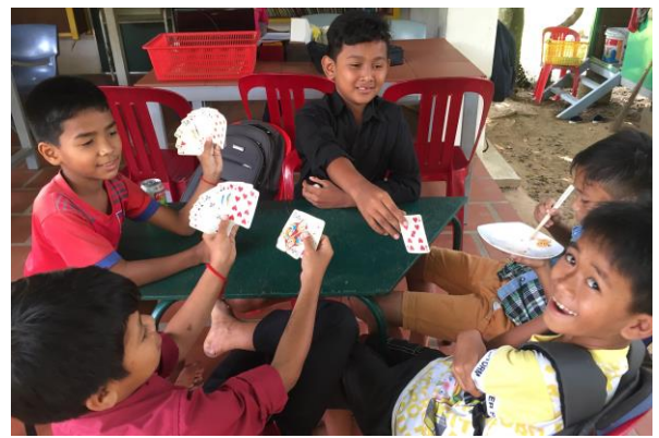
Not gambling I hope?