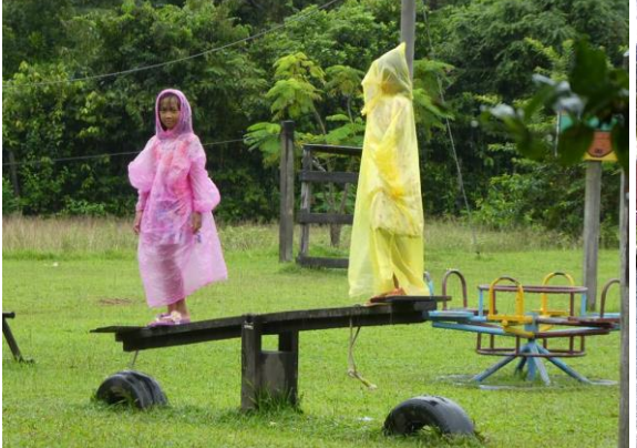
Rain won't stop us from playing!