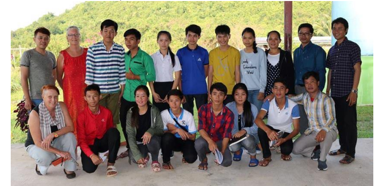
Kep Gardens and Buddhist Library teams