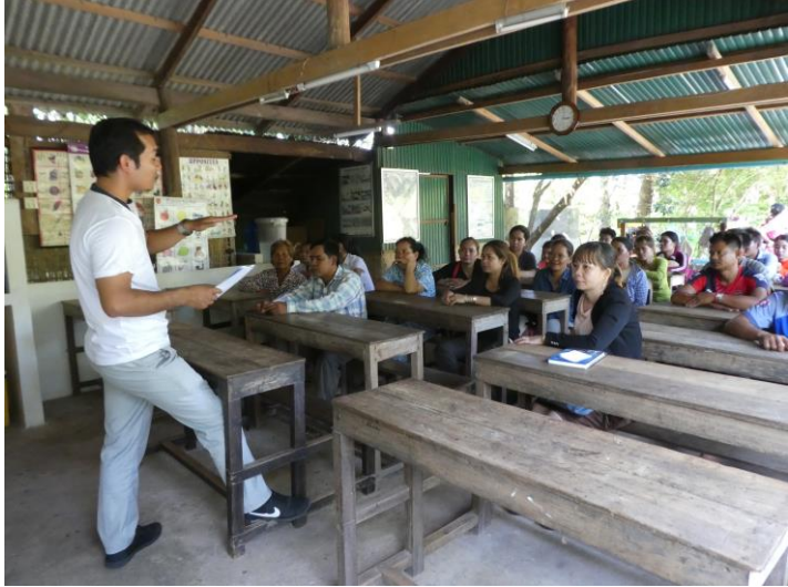
Took this picture early, for most of the session, the desks were full.