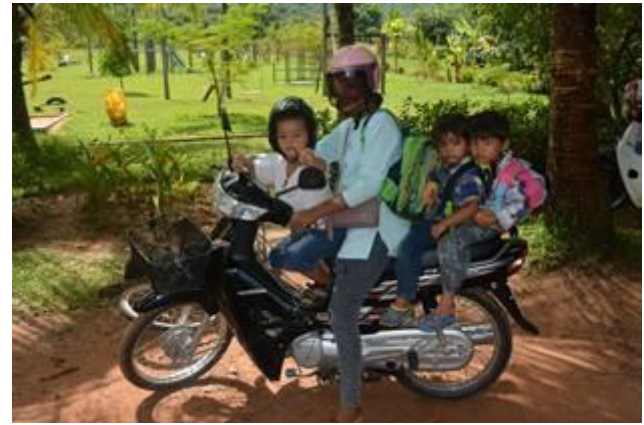
Family off home after playgroup