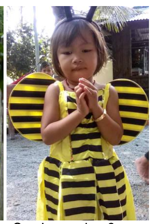
Can I see a bee?