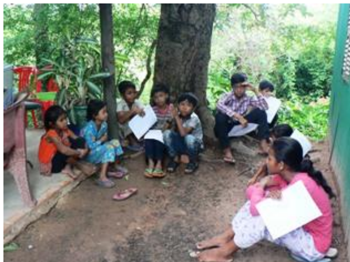
Waiting their turn!!

Pretty tough kids. No injections for fillings or if they take out small teeth. But they do give an injection for bigger teeth needing extraction. Next year we will have an information day a week or so before the Dental Clinic visit as this year there were a few rumours going around about upper teeth attached to your brain and if they get pulled out, it affects your brain; the clinic just takes out teeth and you have lots of problems after. So we have to try and knock these rumours on the head as some did not attend this year because of them.